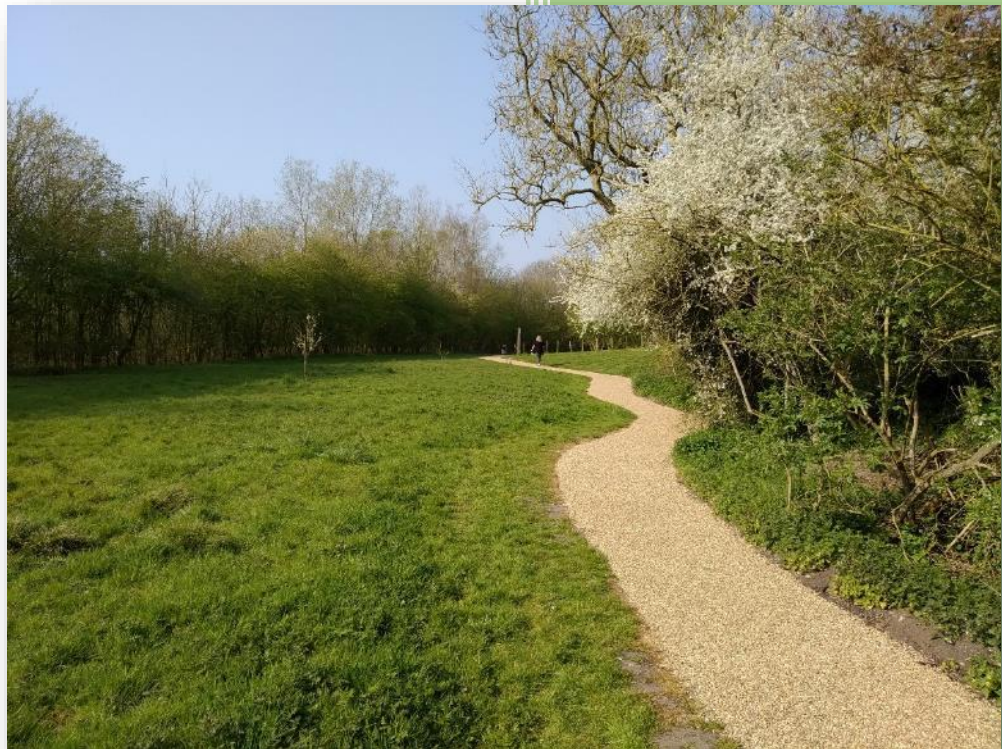
Pocket Park, a proposed Local Green Space in Scole