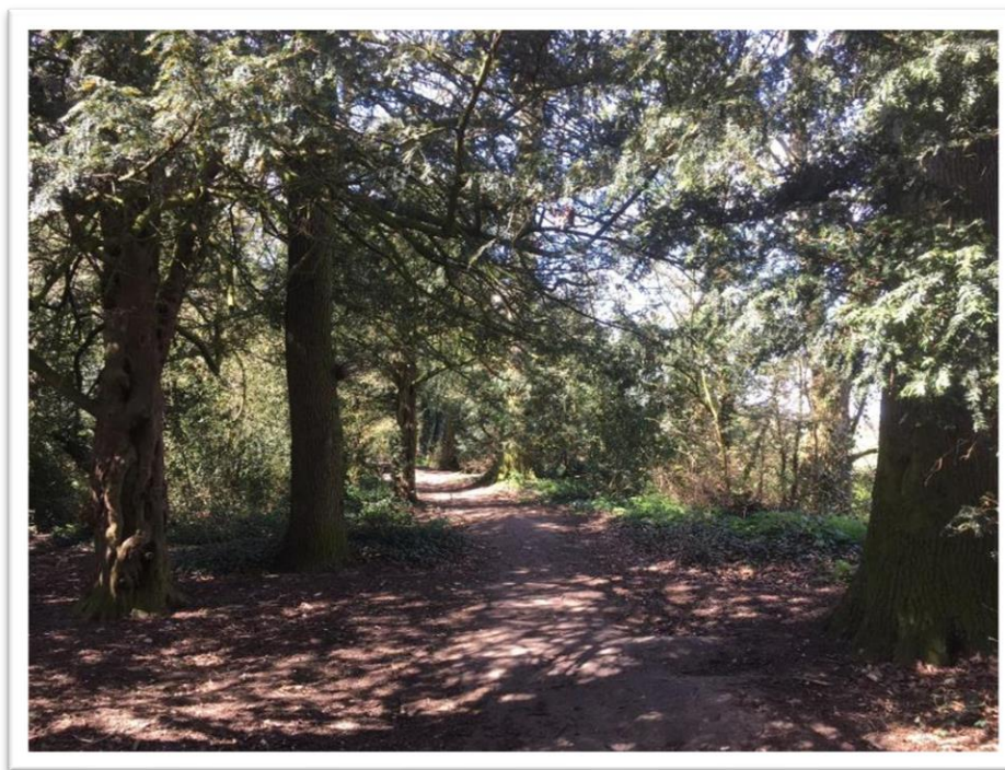
Local Green Space image 1: Swamp Lane Wood, Roydon

Any landowners affected by LGS designation were specifically contacted to make them aware of the potential implications and given the opportunity to provide their views.