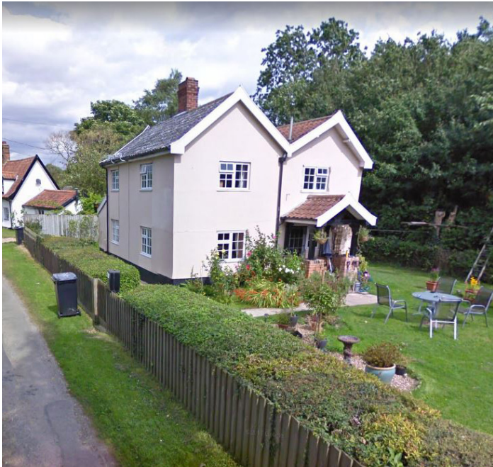
Figure 109: Building detail on Hall Lane, Shimpling.