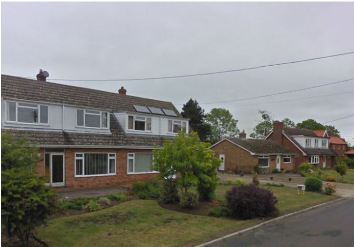
Figure 106: Two-storey semi-detached house On Crown Green, Burston.

The majority of the dwellings have slate or tiled roofs, red/ yellow brick or rendered walls and UPVC windows.