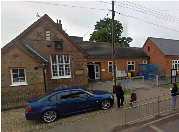
Figure 107: Primary School on Crown Green.