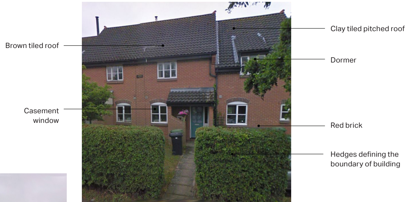
Figure 110: Red-brick dwelling with a clay tile roof on Mill Road, Burston.

Roads are wide with occasional green verges along the road as can be seen in figure 109. The building frontages are set back from roads to create enough space for front gardens, green verges and shrubs.