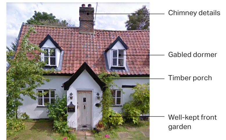
Figure 112: A family house on Hall Lane, Shimpling.