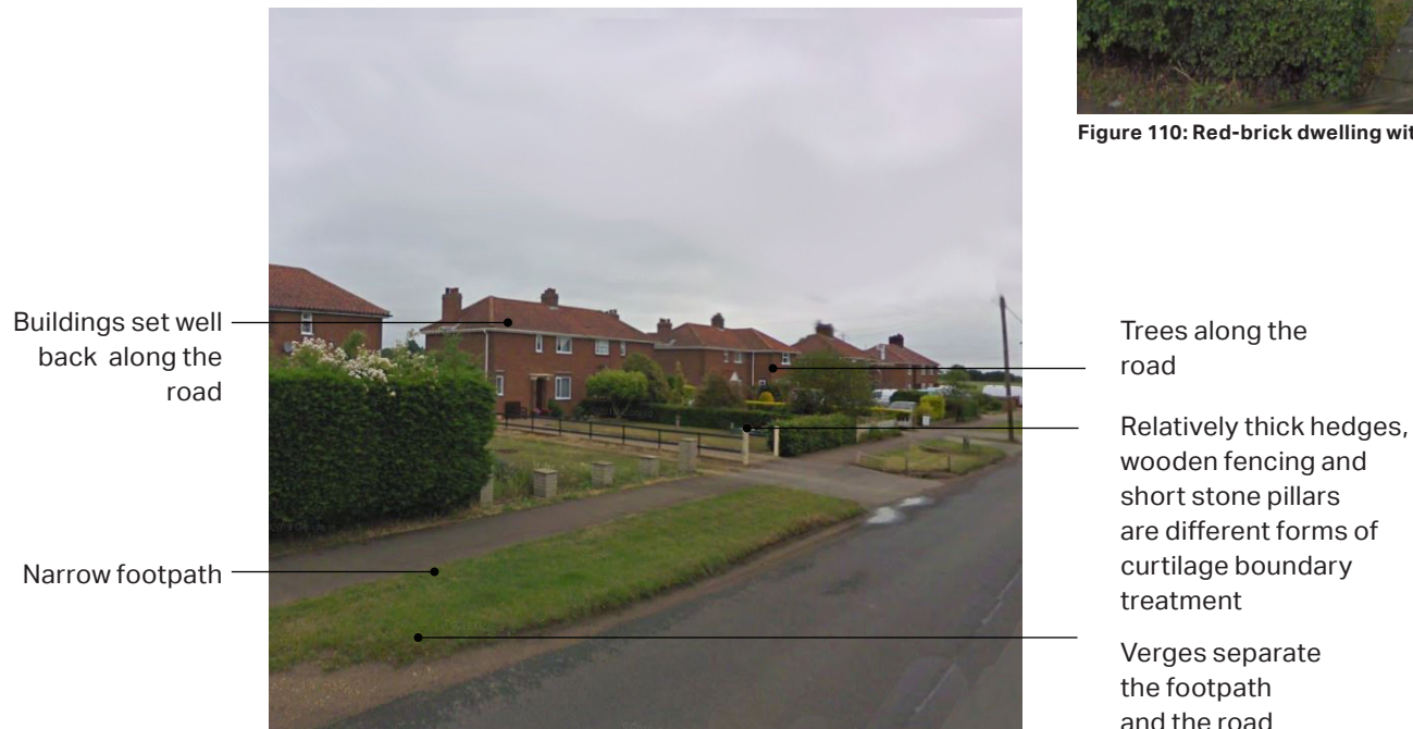
Figure 111: Boundary treatment on Station Road, Burston.